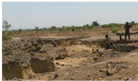
Group 1 & 3 activity site Site visit of a blackmountain and a green park site where KMC offers free.