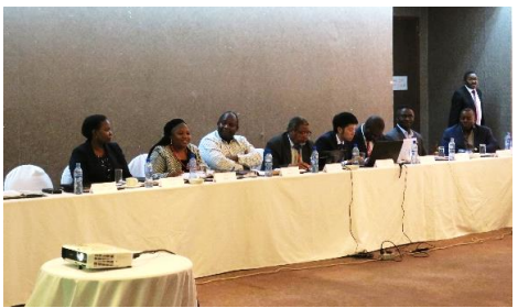
Q&A KAMPAI members answered questions from various stakeholders.