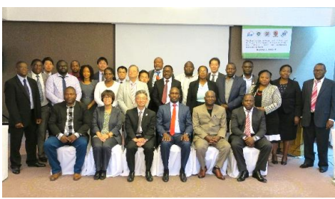
32 participants Lots of effort & support were key in the success of JCC. We appreciated all for their contributions.