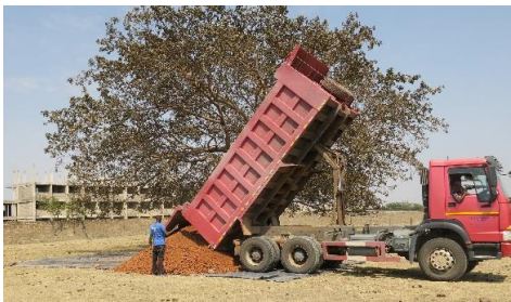
Carry tailings from Kabwe 5th Oct 2017 Tailings from blackmountain were transported from Kabwe into UNZA.