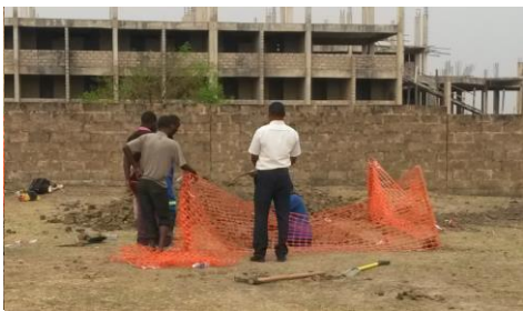
Drain Excavation of surface soil for pilot tests and excavation of pit for effluent.