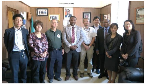
Courtesy call to Kabwe Mayor 17th Oct 2017 Inspection of Kabwe site by JICA HQ, JICA Zambia DRR and in charge.