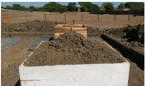
Pilot test Pilot-scale embankment experiments in UNZA.