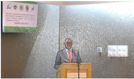
Opening Remark 16th Oct 2017 Opening remarks by a new PS of MOHE @ Intercontinental Lusaka.